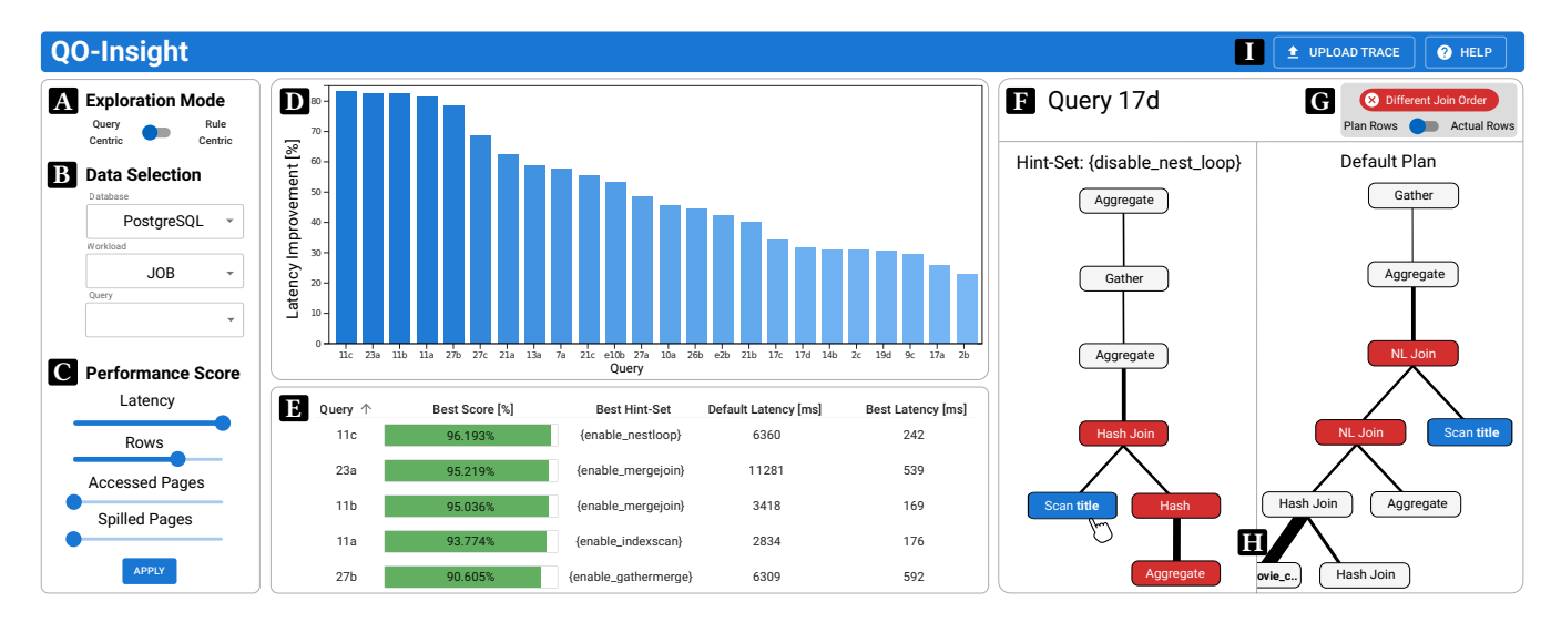
Figure 2: Screenshot of QO-Insight's user interface showing the query-centric mode when selecting a database and a workload.

score can be any combination of individual performance metrics, such as latency , number of processed rows , number of accessed pages , and number of pages spilled to disk , depending on what data the steering tool or the database makes available. Users can adjust the weight of each metric via sliders. When they apply new weights, QO-Insight compares each performance number to the default query plan, calculates the relative changes, and multiplies them with the user-defined weights, which results in the overall score , which will be higher for better plans, 0 for the default plan, and negative for worse plans.