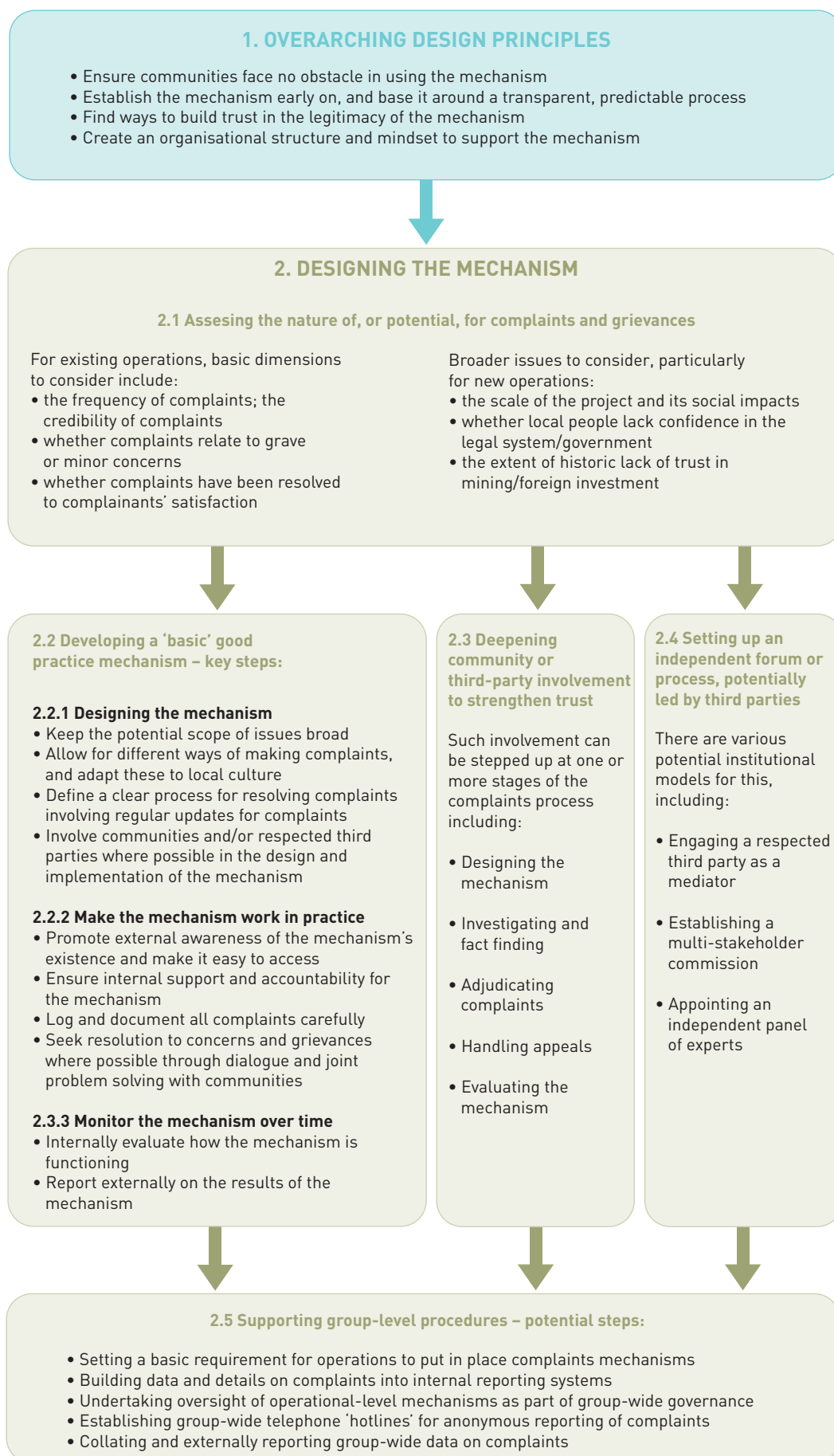
Diagram 1: Overview of main practical aspects of the guide