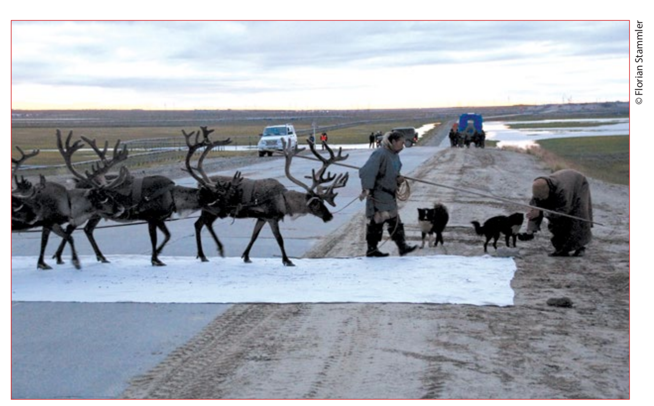
Gazprom and the herders have an informal agreement that the company places fabric on roads and slopes in summer to reduce wear on wooden sledge runners when herders cross hard-surfaced roads. This level of detailed cooperation and good will could not be achieved through international guidelines, but only through personal contact and negotiation on the ground.