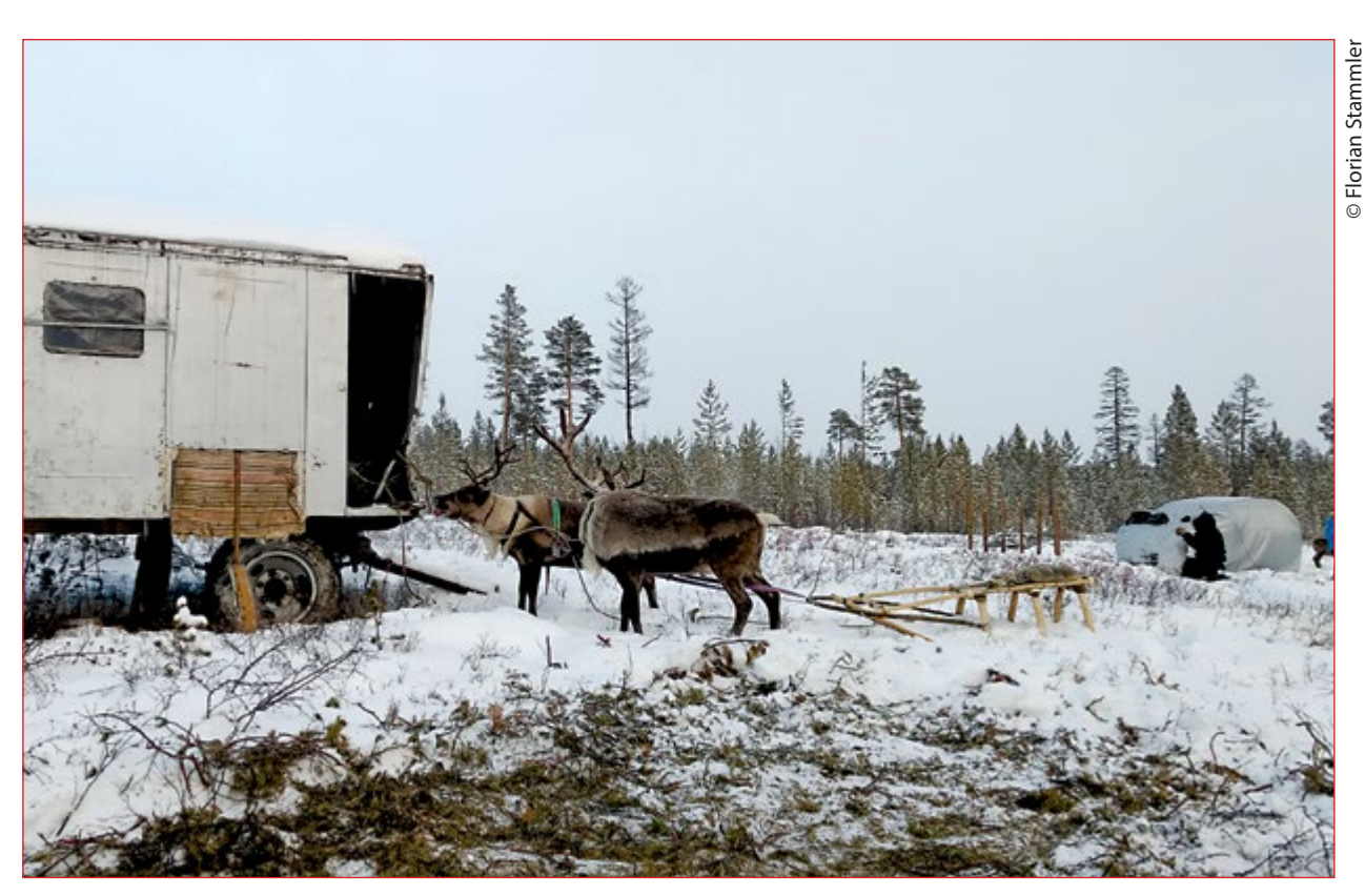
Land use of indigenous reindeer herders and incomer people increasingly overlap in South Yakutia, while land rights are not finally settled.

wishful thinking that a company would track the performance of their subcontractors, and that communication with affected stakeholders (as required in Principle 21) existed only on paper (the IPIECA document also mentions similar problems of supply chain management). While the indigenous land users had the telephone numbers of a company's community liaison officers as one aspect of a grievance mechanism (Principle 29), in several cases these contacts were not working in practice. In general, people in the field expressed clearly their conviction that companies need to have a constant regional presence if they want to work in the area. However, in reality, most companies do not have local representatives, and this applies especially to subcontractors. In such cases, the contacts for grievances were over 5,000 kilometres away in Moscow. This was a serious deficiency in the implementation of any guidelines, whether voluntary or mandatory.