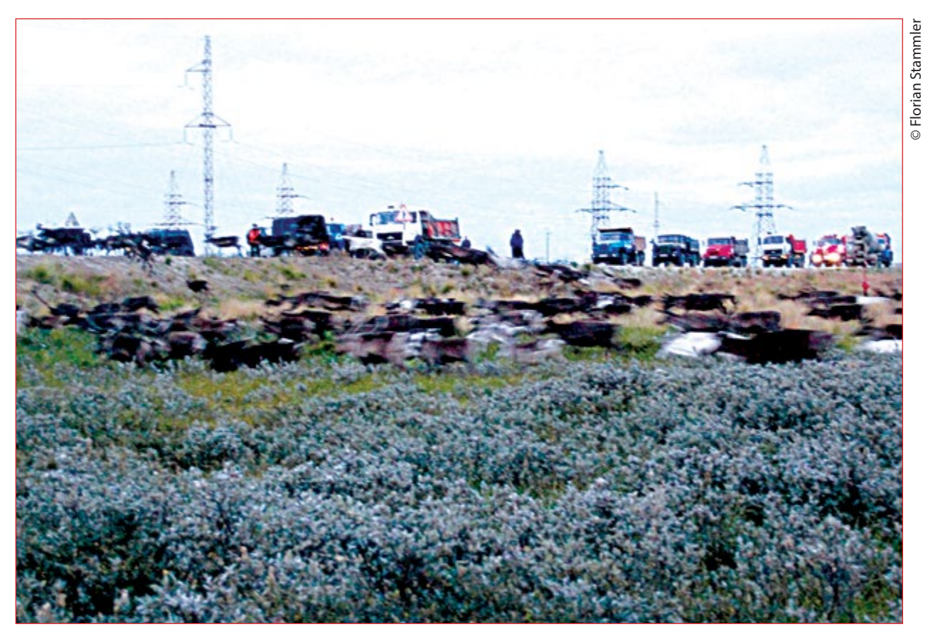
Nomadic reindeer herders crossing the gas deposit supply road at Bovanenkovo, Northwest Yamal. The queue of company-trucks is held up and controlled by traffic police and security services.